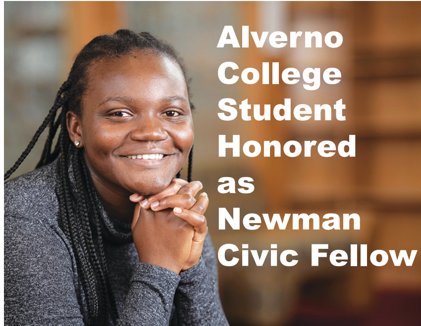
Alverno College Student Honored as Newman Civic Fellow

BULK RATE U.S. POSTAGE MILWAUKEE, WISCONSIN PERMIT 4668