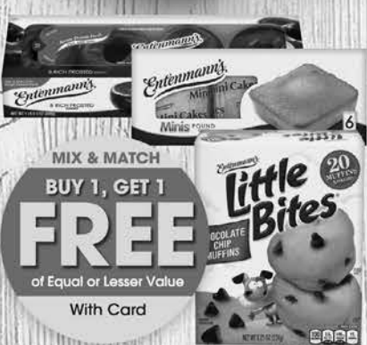
Entenmann's Little Bites, Donuts or Cakes Select Varieties, 5-12 ct