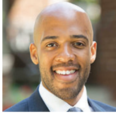
U.S. Senate Mandela Barnes (D)

In Wisconsin, Gov. Tony Evers retained his office, defeating Republican business-