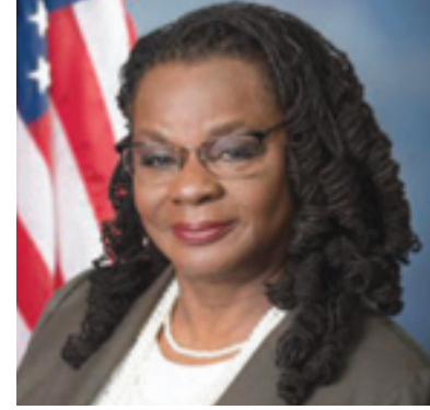
U.S. Congress Dist. 4 Gwen Moore (D)

The re-elected governor told voters during his victory speech that democracy was on the line and on the ballot with Michels,