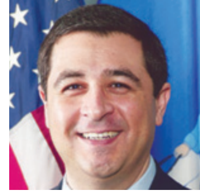
Wisconsin Attorney General Josh Kaul (D)

In another hotly contested state election with national implications, the race between incumbent Republican U.S. Sen. Ron Johnson and Democratic challenger, Lt. Gov. Mandela Barnes wasn't decided until