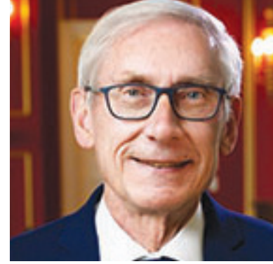
Wisconsin Governor Tony Evers (D)

Michels favored disbanding the state's bipartisan elections commission and had promised to sign bills vetoed by Evers that would make it harder to