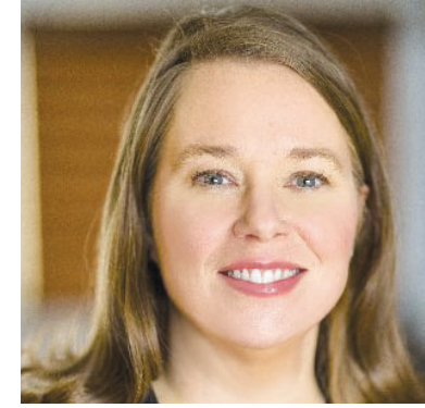
Wisconsin Lt. Governor Sara Rodriguez (D)

"You showed up because you saw our democracy was on the brink of existence and you de-