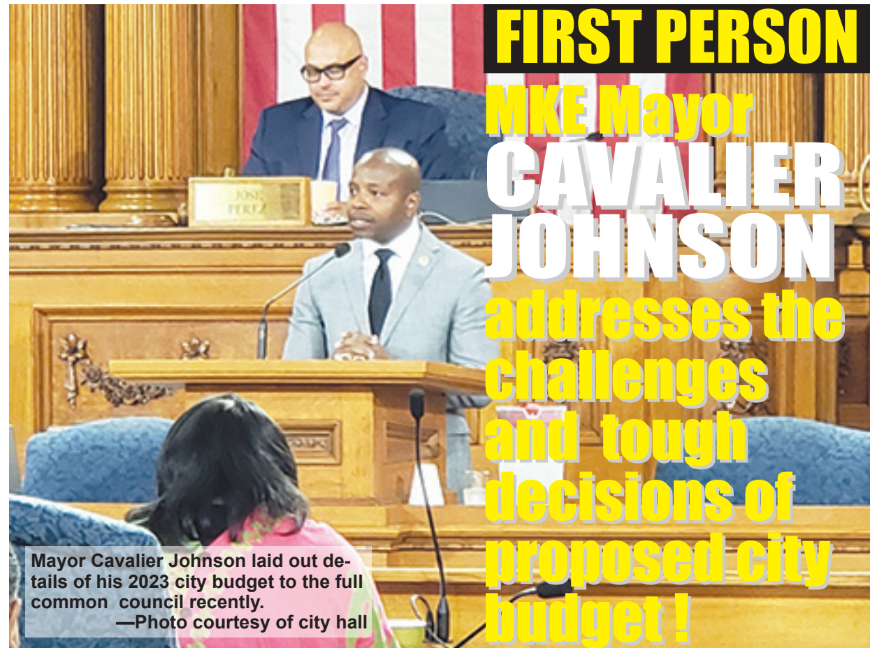
Mayor Cavalier Johnson laid out details of his 2023 city budget to the full common council recently.