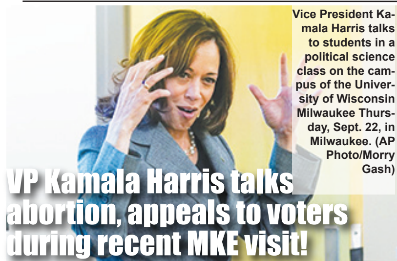
Vice President Kamala Harris talks to students in a political science class on the campus of the University of Wisconsin Milwaukee Thursday, Sept. 22, in Milwaukee.

Nevertheless, in the budget process, we must face the facts. Insufficient resources have forced cuts and limited our ambitions for city government. This coming year we will work through the financial restrictions, and I am optimistic the future will bring the change we need."