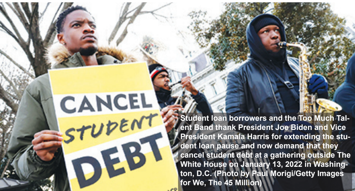
Student loan borrowers and the Too Much Talent Band thank President Joe Biden and Vice President Kamala Harris for extending the student loan pause and now demand that they cancel student debt at a gathering outside The White House on January 13, 2022 in Washington, D.C.

—Clyburn's op-ed courtesy of NNPA news service