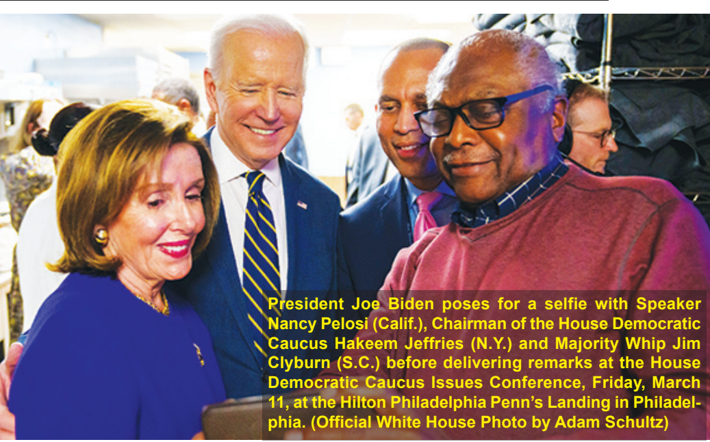
President Joe Biden poses for a selfie with Speaker Nancy Pelosi (Calif.), Chairman of the House Democratic Caucus Hakeem Jeffries (N.Y.) and Majority Whip Jim Clyburn (S.C.) before delivering remarks at the House Democratic Caucus Issues Conference, Friday, March 11, at the Hilton Philadelphia Penn's Landing in Philadelphia.