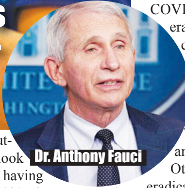
Dr. Anthony Fauci