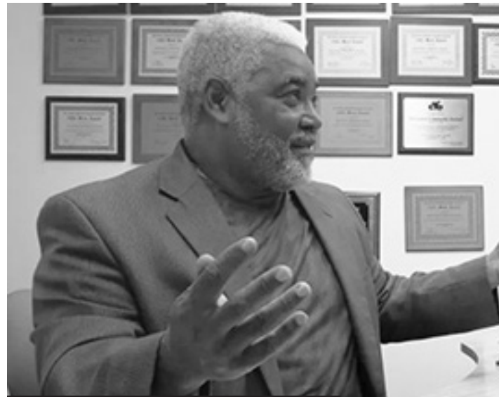
with shared values, not a ready-made family.

And in truth, many brothers feel they can bounce from woman to woman—Neckbone to Neckbone—assuming they are desperate and easy.