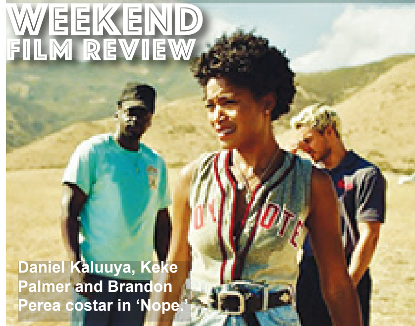
Daniel Kaluuya, Keke Palmer and Brandon Perea costar in 'Nope'