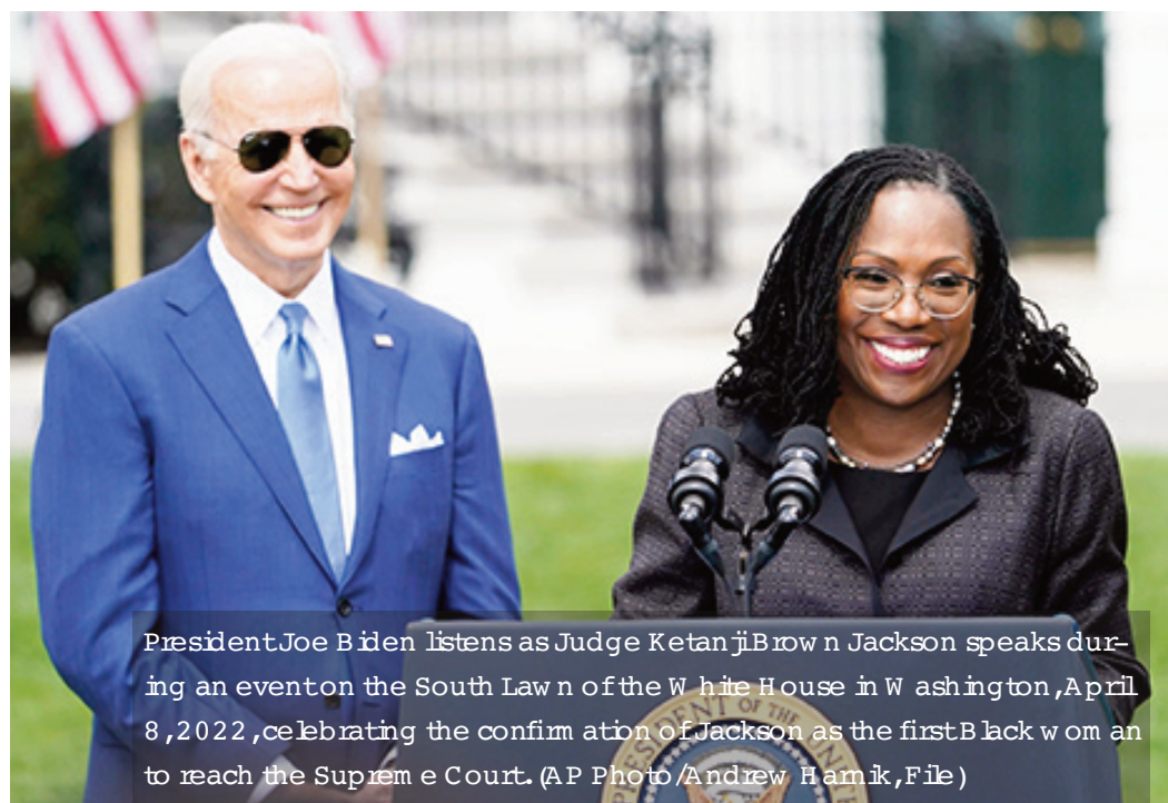
President Joe Biden listens as Judge Ketanji Brown Jackson speaks during an event on the South Lawn of the White House in Washington, April 8, 2022, celebrating the confirmation of Jackson as the first Black woman to reach the Supreme Court.