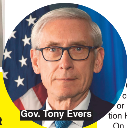
Gov. Tony Evers

Consumers are encouraged to contact the Wisconsin Department of Agriculture, Trade and Consumer