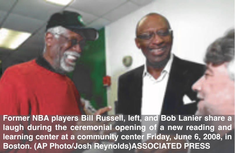
Former NBA players Bill Russell, left, and Bob Lanier share a laugh during the ceremonial opening of a new reading and learning center at a community center Friday, June 6, 2008, in Boston.