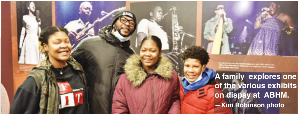
A family explores one of the various exhibits on display at ABHM.