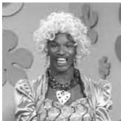
Actor Jamie Foxx as the character 'Wanda Wayne' on the 90s show 'In Living Color' She could be the photo that accompanies the definition of a neckbone. placing a public school system with a system of public schools.

My 'redefinition/clarification gets to the heart of another of my philosophical wish list: re-