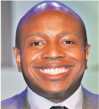
* CAVALIER JOHNSON 25,779 (42%)

Johnson garnered 25,779 votes to Donovan's 13,742. State Sen.