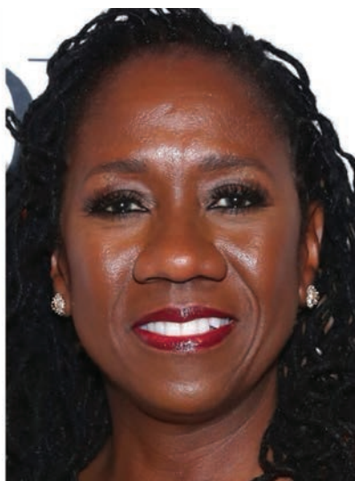
Ketanji Brown Jackson (L) and Sherrilyn Ifill (R)

A White House source tells theGrio that conversations are being had over possibilities to fill the soon-to-be vacant Supreme Court seat after recent reports indicated that Justice Stephen Breyer is retiring after serving on the High Court for nearly three decades.