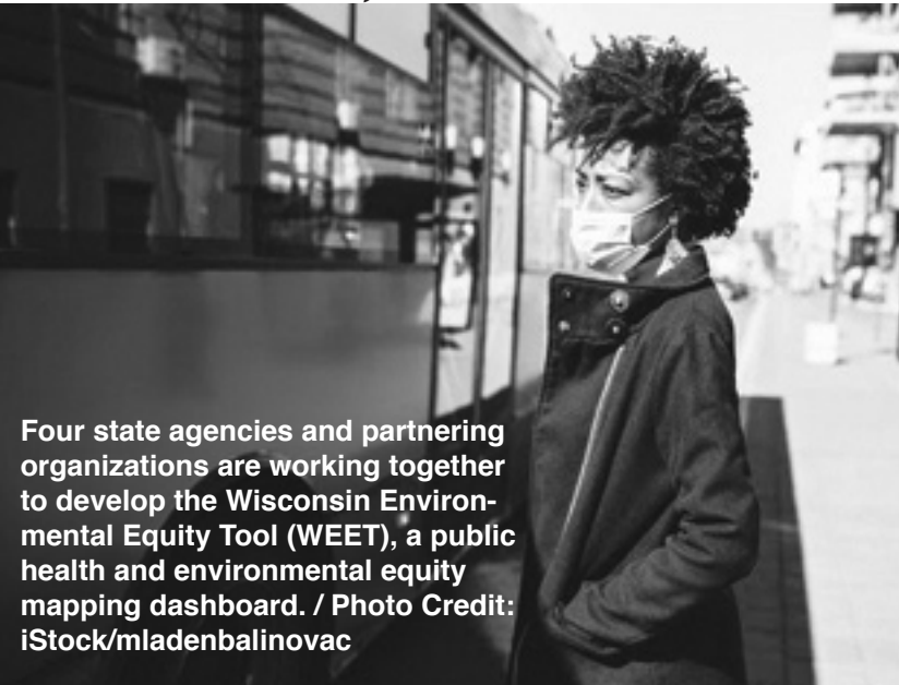
Four state agencies and partnering organizations are working together to develop the Wisconsin Environmental Equity Tool (WEET), a public health and environmental equity mapping dashboard.

Community Listening Sessions To Be Held Nov. 2, 4 And 6