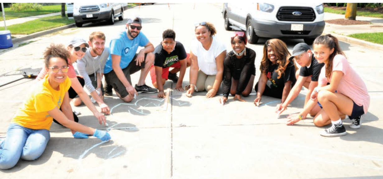
Local Harambee residents—students, parents, and neighbors like the ones shown above—recently helped create several community-created paintings along North Ave.