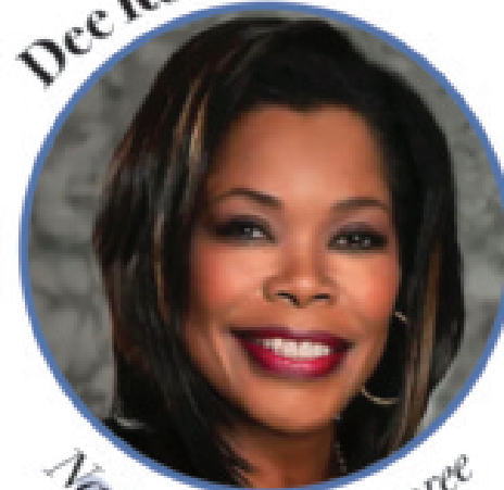
National Civic Honoree