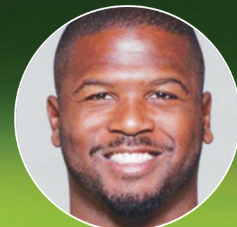
LEROY BUTLER Legends Honoree