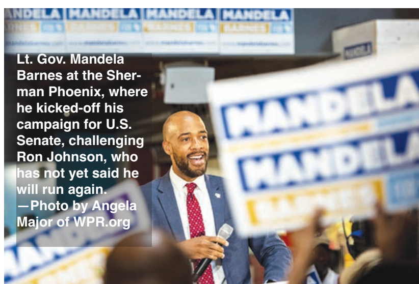
Lt. Gov. Mandela Barnes at the Sherman Phoenix, where he kicked-off his campaign for U.S. Senate, challenging Ron Johnson, who has not yet said he will run again.