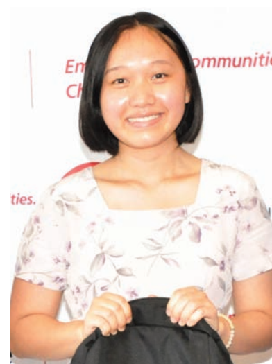
Laina Vue Hmong American Peace Academy