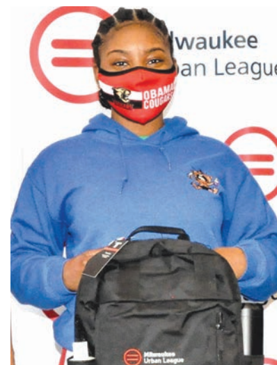
Neveah Jeanes Barack Obama SCTE