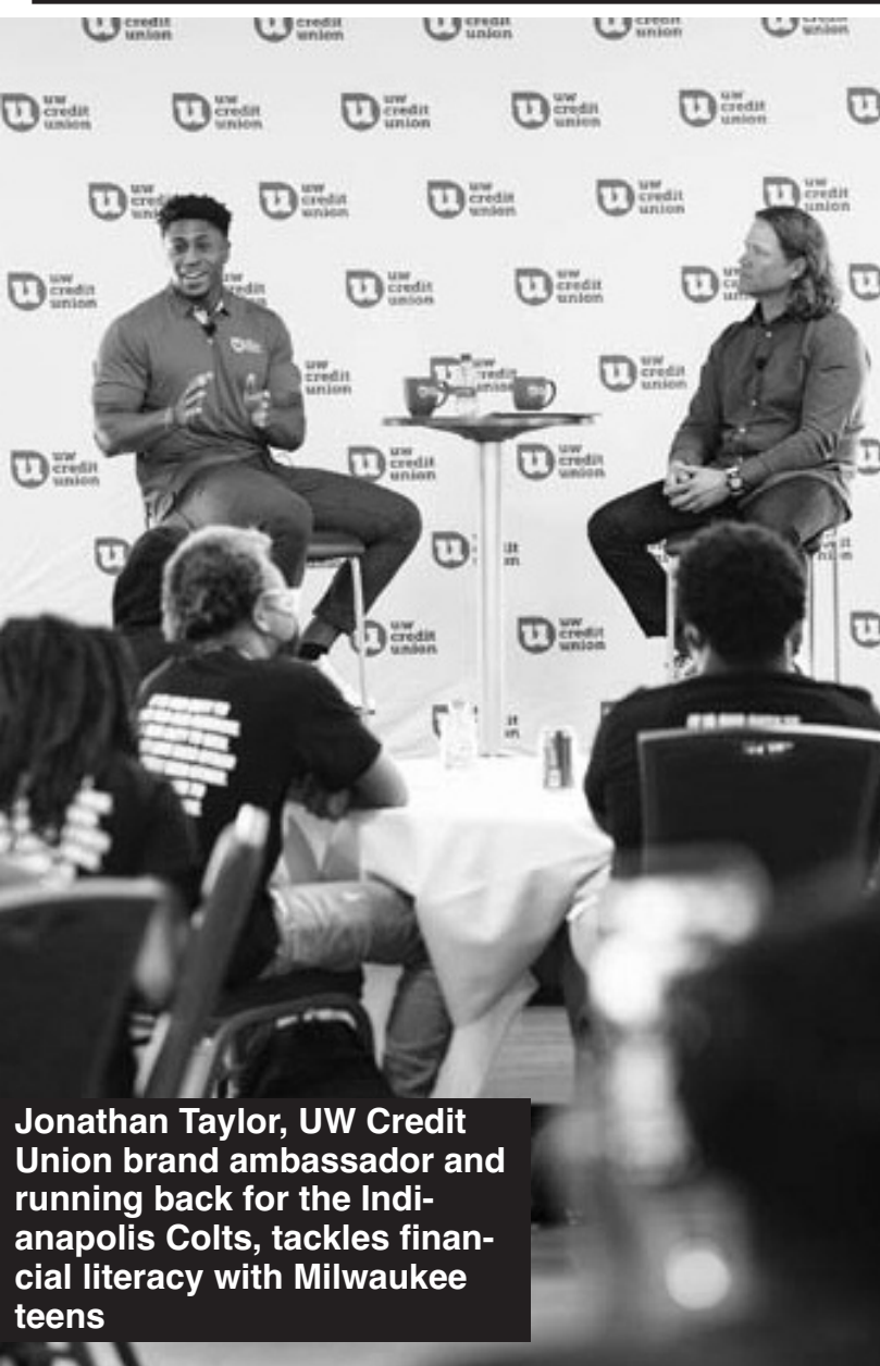
Jonathan Taylor, UW Credit Union brand ambassador and running back for the Indianapolis Colts, tackles financial literacy with Milwaukee teens

"We cannot let this happen again. People must be held accountable and that means the whole enterprise must be thoroughly investigated." —People For the American Way President Ben Jealous