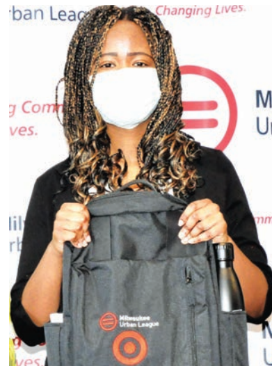
Alycia Berete Golda Meir Upper Campus