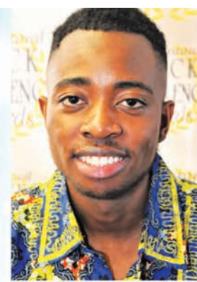
Davidi Alepembwe Bradley Technical High School