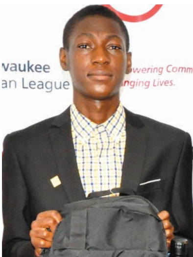
Israel Akinsanya Rufus King International High School