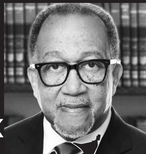
Dr. Benjamin Chavis, president of the National Newspaper Publishers Association-Black Press USA

Despite the pandemic, YOUR Milwaukee Community Journal, is still getting ads from companies and businesses considered "essential" such as food stores. We've even highlighted Black businesses (especially restaurants) that are still "open for business." Like other businesses, the Milwaukee Community Journal is an “ESSENTIAL” business that is the Milwaukee Black community's main source of news, information, edu- cation and inspiration about and for us!