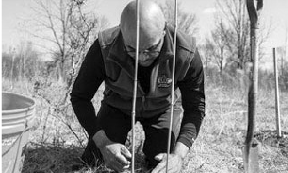
The DNR plans to conduct a tree planting program targeting low-income urban communities that would help to address inequity in tree planting. Urban tree planting disproportionately benefits high income neighborhoods.