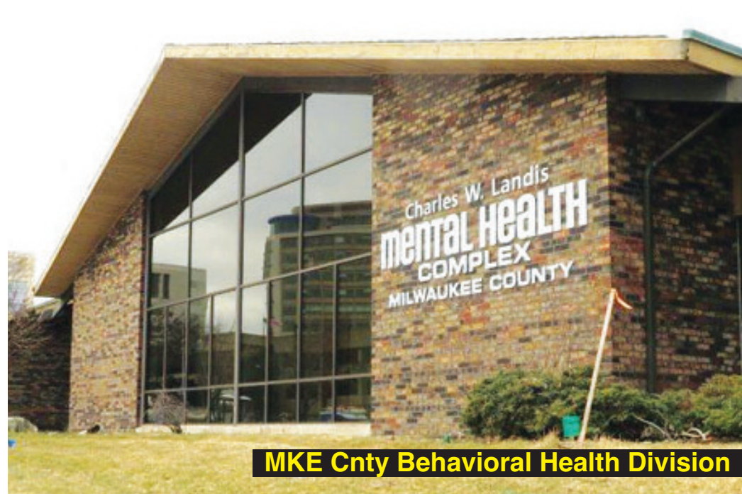
MKE Cnty Behavioral Health Division