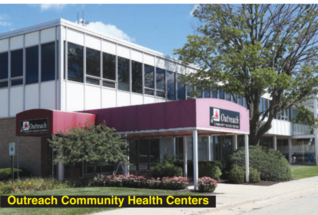
Outreach Community Health Centers