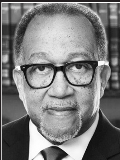
Dr. Benjamin Chavis, president of the National Newspaper Publishers Association- Black Press Usa

JoinAllofUs.org/wisconsin allofus@mcw.edu