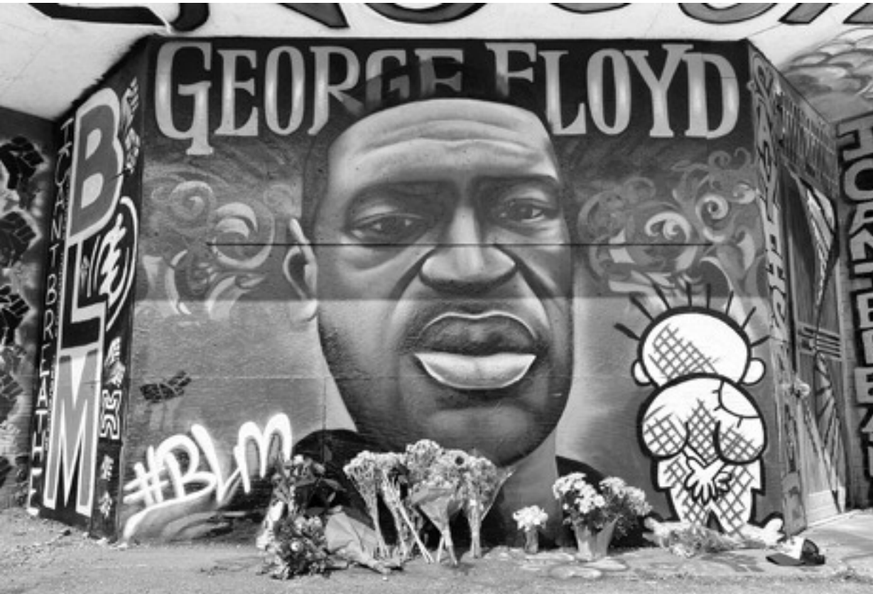
Mural honoring George Floyd and other victims of police killings at the corner of North Holton and East North Avenue by various Milwaukee artists.