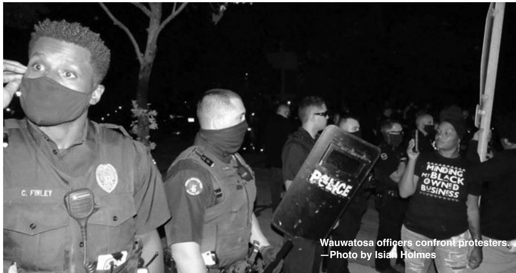
Wauwatosa officers confront protesters.