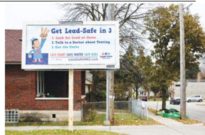
Lead testing is down 39 percent in 2020, including a 27 percent decline in the number of children tested.