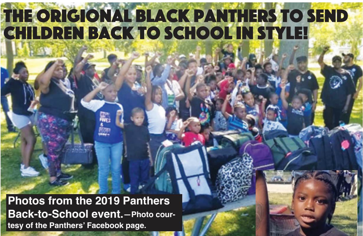
Photos from the 2019 Panthers Back-to-School event.

The Original Black Panthers will hold its 5th annual Back-to-School event Saturday, August 22, in the Fryerz’s parking lot, located at 2636 W. Fond du Lac Ave. from 12 noon to 3 p.m. The first 100 children who register for the event will be given brand new athletic shoes in a brand new book bag containing school supplies. The Panthers will also feed the children, neighborhood—and community—with a bar-b-que cookout. Registration of children for the event is happening NOW! To register, call the Panthers at 414-366-0221. Registered children and their parents MUST be present!