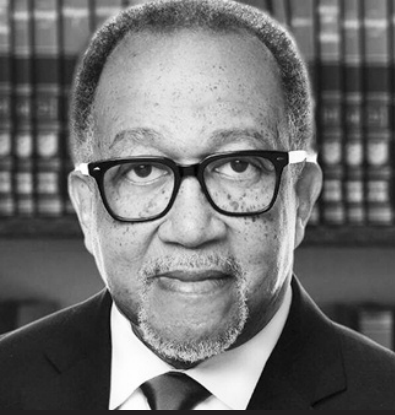
Benjamin Chavis, president of the National Newspaper Publishers Association-BlackPressUSA

Dated: 6-19-2020 BY THE COURT WILLIAM SOSNAY 174/7-29/8-5-12-2020