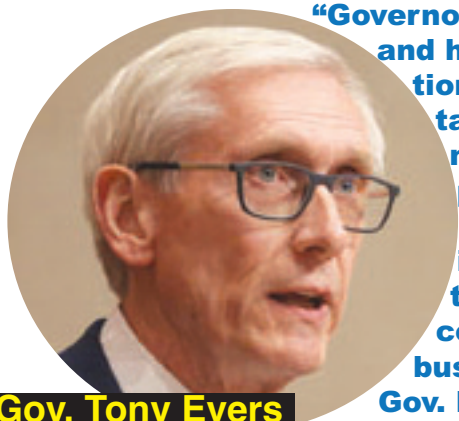
Gov. Tony Evers

For Our Future Wisconsin has gathered over